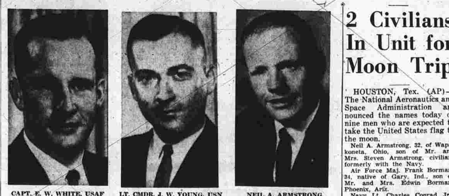
CAPT. E. W. WHITE, USAF LT. CMDR. J. W. YOUNG, USN NEIL A. ARMSTRONG MAJ. FRANK BORMAN, USAF LT. CMDR. J. A. LOVELL, USN ELLIOTT M. SEE JR. CAPT. T. P. STAFFORD, USAF LT. CHARLES CONRAD, USN CAPT. JAMES McDIVITT, USAF